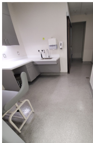
Epoxy/resinous flooring options are great for schools, hospitals, and other applications.