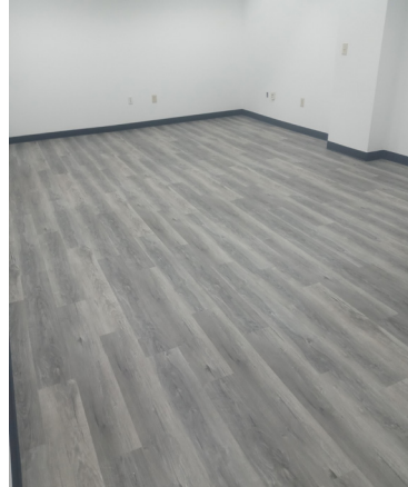
Luxury Vinyl Tile